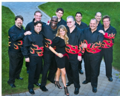
6:00 p.m. "The Infernos"